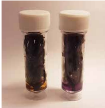
Figure 2 - Samples of Knotted wrack in hydrocarbonate indicator after illumination. Samples were either covered with black paper (LHS) or exposed to light (RHS).

8) Once the basic protocol is established there are lots of opportunities for varying the experimental parameters e.g. the effect of light intensity on photosynthesis rate.