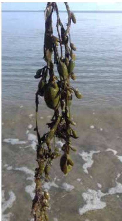
Figure 1 - Ascophyllum nodosum - also known as Knotted wrack.

Within SSERC we continue to explore the use of hydrogencarbonate indicator as a convenient experimental system for demonstrating both photosynthesis and respiration in plants [1] and we have recently extended our range of published protocols to include materials in support of the SQA assignment for revised National 5 Biology [2]. Without doubt Cabomba has, over the years, proved to be our plant of choice [3] although since it was placed on the 'banned list' [4] we have had to switch our allegiance to Egeria najas .