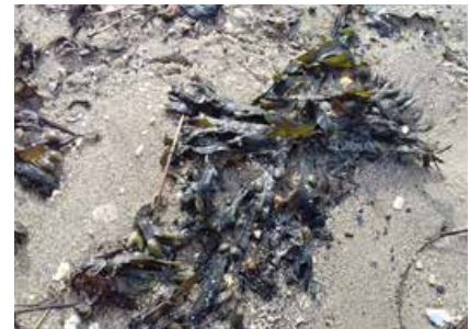
Figure 3 - Sample of Bladder wrack.

The role of marine ecosystems in capturing organic carbon (so-called 'blue' carbon systems) is increasingly being recognised (see for example [6] which is based on a fuller article [7]) and we believe that the experimental system described here will allow students to do experimental work in a field which from a global perspective is both important and topical. <<