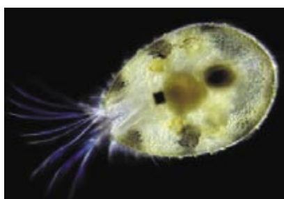
Figure 3 - Ostracod (image: http://www.microscopy-uk.org.uk/mag/smallimag/ostra.jpg ).

The good thing is that dessicated sea fireflies are now available from Scientific and Chemical (product number $203431, 1 g quantities) - lots of fun to be had!