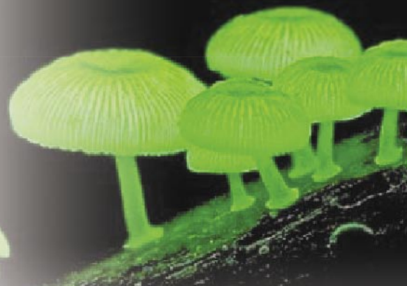
Figure 2 - Bioluminescent fungi (Image: https://www.scineon.com/mushroom/bioluminescent-mushroom-glow-in-dark-to-attract-insects ).

It has been about five years since we looked at the topic of bioluminescence [1] in this Bulletin. Since that time there have been some revisions to the documentation relating to both Higher Biology and Higher Human Biology qualifications [2, 3] but in both subjects one of the suggested learning activities continues to be 'Experiments on ATP dependent reactions, e.g. luciferase, luminescent reactions'.