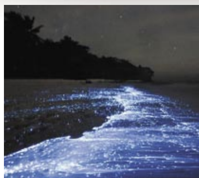
Figure 4 - Bioluminescence from 'sea fireflies' (image: http://bluehorizonboutiqueresort.com/wp-content/uploads/2015/12/540b371e5fb229aa52effe65a045c6f7.jpg ).

One of the most impressive bioluminescent organisms which is described is the humble ostracod, also known as the 'sea firefly', which 'pound for pound'