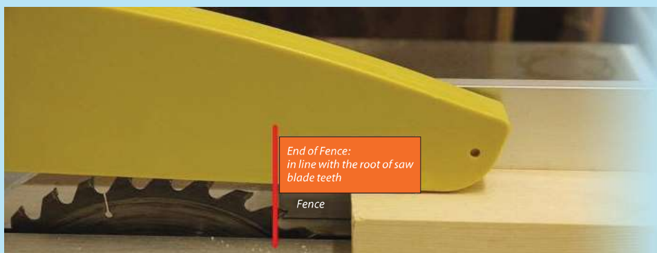
Figure 3 - Correct Fence Setting to Prevent Kickback- taken from the Poster.

There are plenty of free, downloadable resources, not for the department work-base shelf but designed to be put into practice in order to maintain high levels of safety when machining.