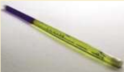
Figure 3 - Immobilised Scenedesmus quadricauda in hydrogencarbonate indicator.

they might observe. Provided that the cylinder is removed carefully and mixing is kept at a minimum then the tube will look similar to the one shown in Figure 2. The algae were originally placed in indicator at pH 7.6 prior to illumination. The left-hand portion of the tube was exposed to the full beam while the right-hand portion was covered with black paper during illumination. Similar effects can be observed with