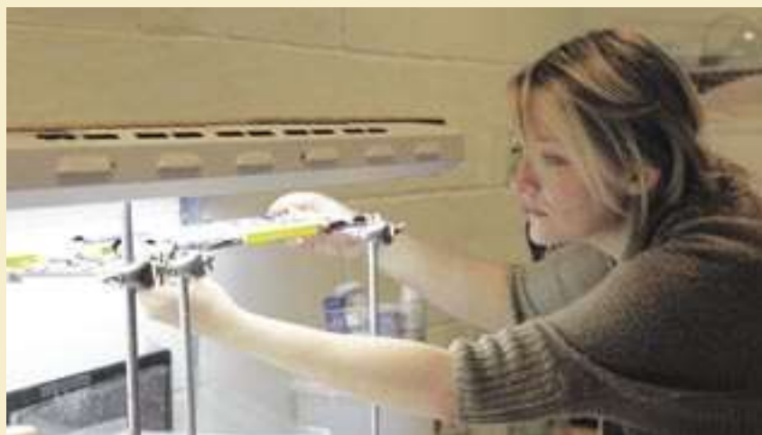
Figure 1 - Delegates at a recent Biology SSERC CPD event carrying out steps 6 and 7!